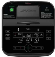
Track Connect 2.0 with Enhanced Bluetooth