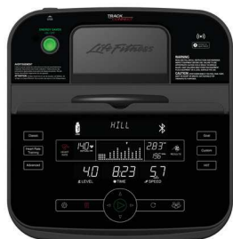
Track Connect 2.0 with Enhanced Bluetooth