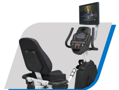
OPTIONAL TV BRACKET (TV NOT INCLUDED)

The CR800 Semi-Recumbent Bike is the perfect bike for the commercial environment. The step-through design makes it easy for your clients to get on the bike, and the easy-adjust seat allows them to find the most comfortable position. The console offers multiple programs, most with 40 levels of resistance and enough feedback information to make sure your clients never grow bored of the CR800. The extra-smooth ride comes from the perfect gearing and the integrated generator/flywheel system.